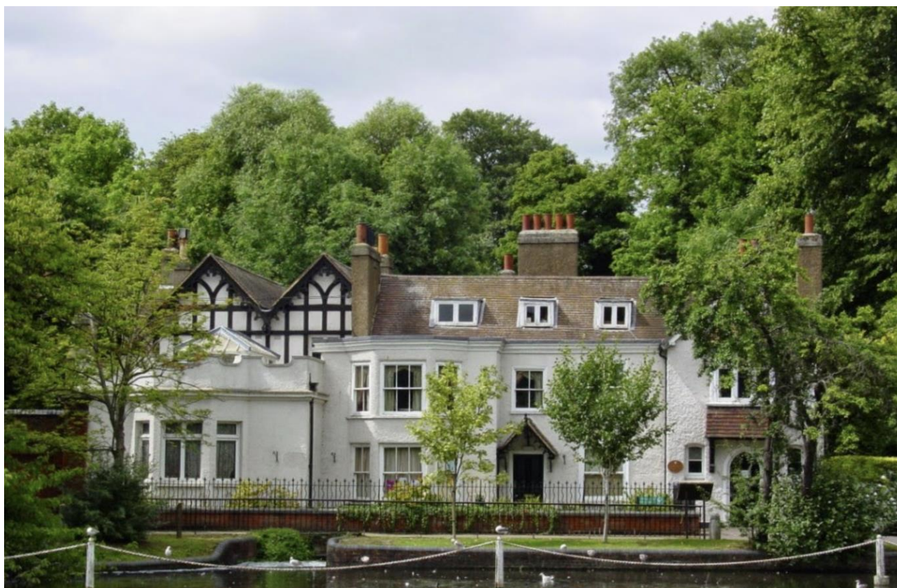
Honeywood Museum, London Borough of Sutton