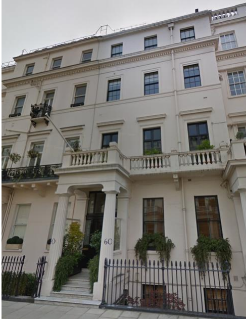
60 Eaton Place, Westminster