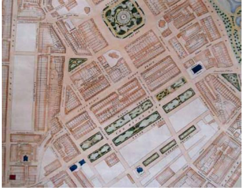
Thomas Cubitt's 1865 Map of the Locale